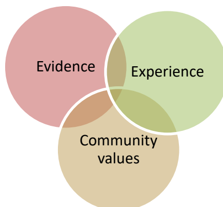
Figure 2: Elements for implementing evidence-based practice, as adapted from California Evidence-Based Clearinghouse and the Institute of Medicine (2001) – see Walsh, Rolls Reutz and Williams (2015)

The model is agnostic to the specific service approaches, rather forming an enabling framework that empowers local communities and ACCOs to develop and adapt responses based on available evidence, practitioner experience and community values (see Figure 2).